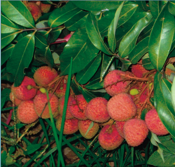
Treated with asiafert fertilizer